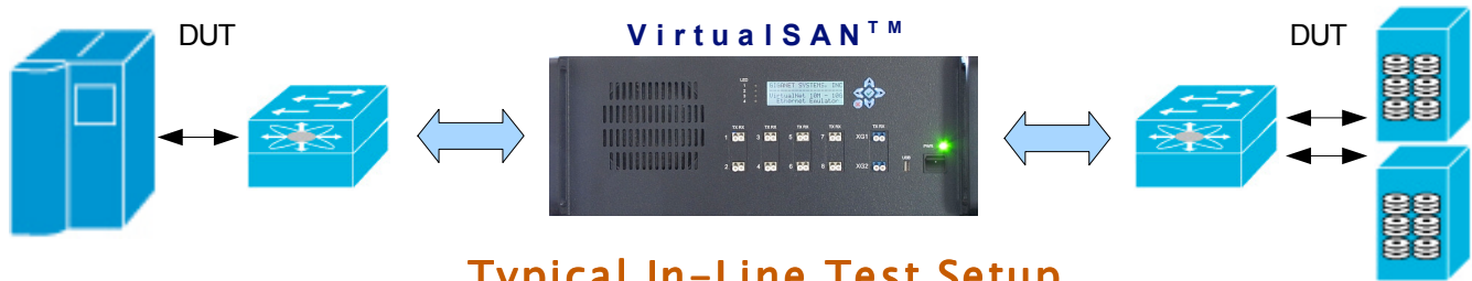
Typical In-Line Test Setup